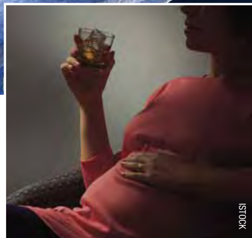
CULTURE OF DENIAL: Facing up to the effects of alcohol during pregnancy

from troubled backgrounds often find themselves in the care of the state.